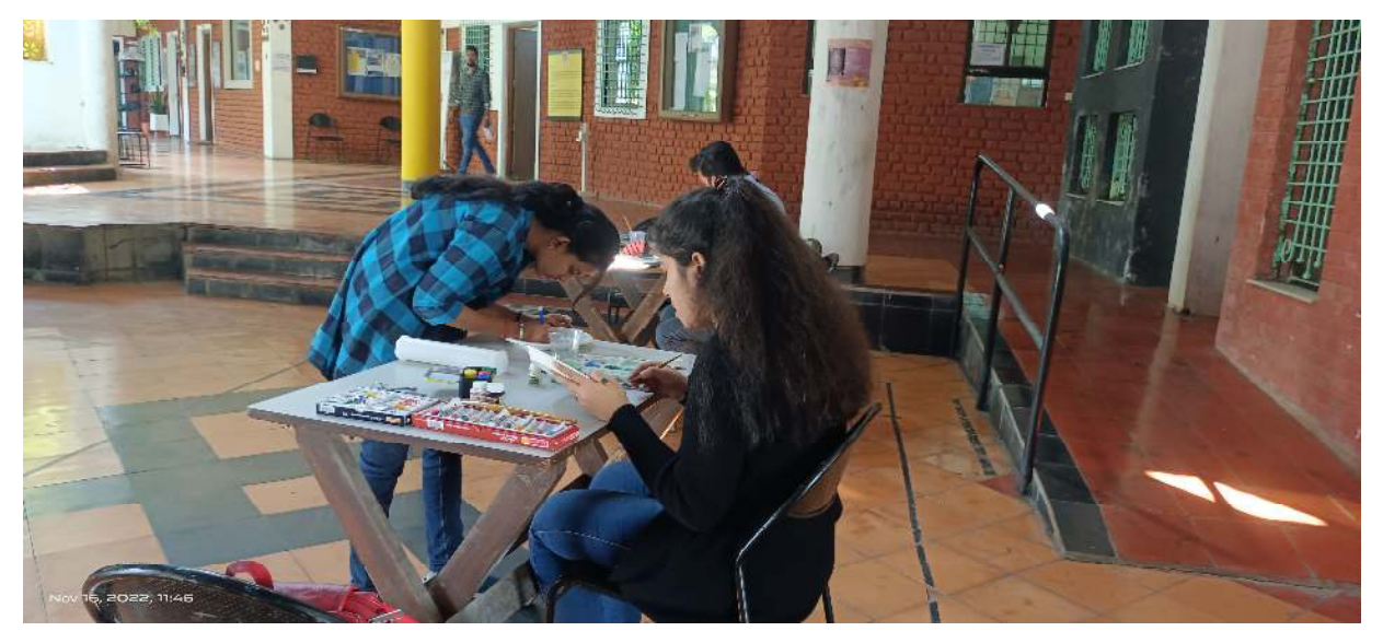
Participants working on their art work in the design comeptition